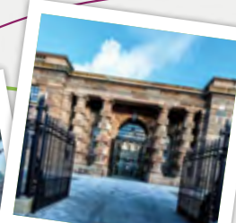
Crumlin Road Gaol