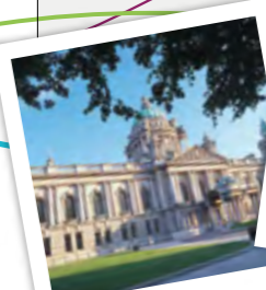
Belfast City Hall

Enjoy a variety of delicious breads and sweet treats in cafes and bakeries across Belfast. Look out for traditional favourites such as soda bread, wheaten bread, scones and huge Belfast baps. Wash them down with a handcrafted coffee or boutique loose leaf blended tea.